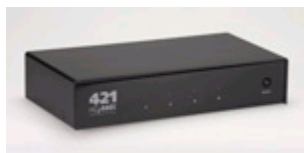
HDMAX 421 switch shown above and 121 Extender below.